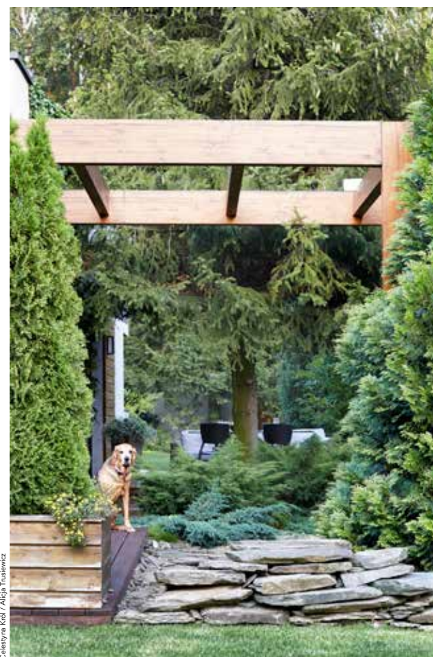
Celestyna Kosi / Alicja Turkiewicz