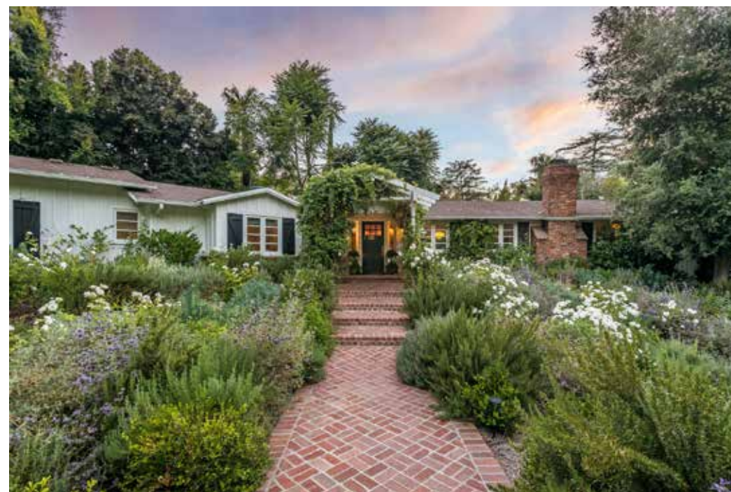
LOCATION: FRYMAN CANYON, LOS ANGELES, CA