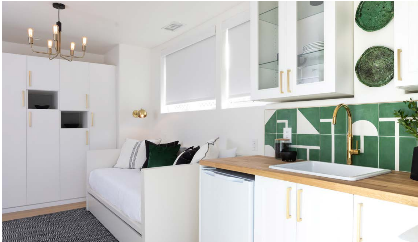
ABOVE/RIGHT The guest apartment has a custom designed wall unit with a pull-down desk, closets and storage compartments. The daybed includes a trundle bed for additional guests. The green Moroccan plates are from Jackson Paige Home. The backsplash is the Brasilia pattern from Popham Tiles.